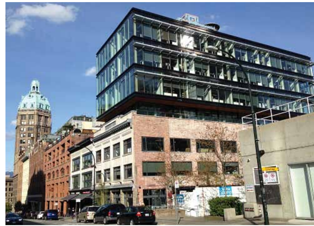
The new four-storey contemporary addition brings the 1909 heritage building into the 21<sup>st</sup> century.

Green or garden roof design is not new, but increasingly owners, developers and even municipalities are requiring green roofs. For 564 Beatty Street, Reliance Properties Ltd. and the architectural team have applied for LEED Core and Shell Gold certification. To meet the